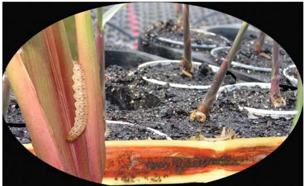
Figure 1. Sugarcane plants exposed to Diatraea saccharalis attack and damage produced by the caterpillars after insect wounding and colonization by opportunistic fungi

available for the control of insect pests. Understanding how insects cope with plant defenses also has proved instrumental into designing new strategies for crop protection. The sugarcane transcriptome project (SUCEST) has allowed the identification of several genes involved in the plant response to insect damage. There are numerous classes of naturally occurring phytochemicals that are thought to confer resistance to plants against herbivorous insects. These classes include lectins, waxes, phenolics, sugars, alpha-amylase inhibitors and proteinase inhibitors. Analysis of sugarcane-expressed genes involved in secondary metabolism suggests that most of the expressed compounds may be acting as defensive barriers to