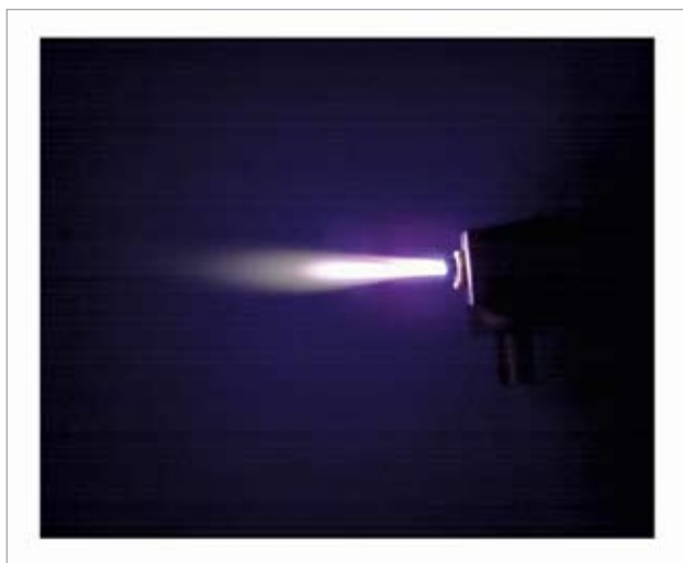
Figure 1. Illustration of an atmospheric-pressure plasma jet of Ar/H 2 generated by a radio-frequency wave at 50W. In this case, the microplasma jet glow length is about 15.0 mm, considering a gas flux of 700 sccm

Brazilian Bioethanol Science and Technology Laboratory (CTBE)