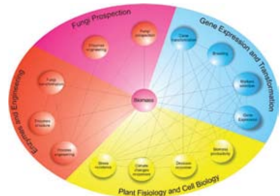
Figure 1. Structure of the INCT do Bioetanol, which is divided in 4 centers that congregate 30 laboratories in 6 states of Brazil