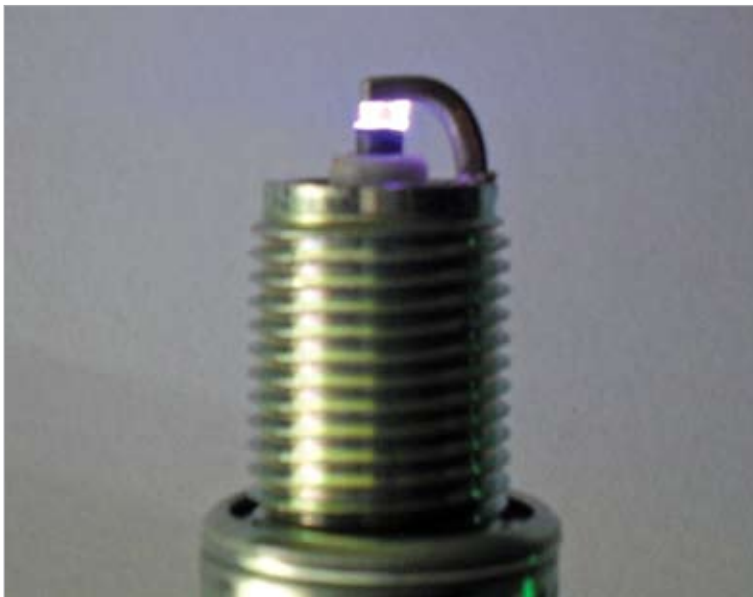
Figure 1. Spark plug electric discharge

Brazilian Bioethanol Science and Technology Laboratory (CTBE)